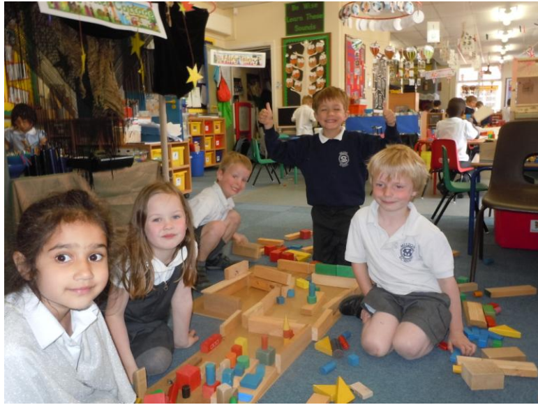
We are proud of our achievements