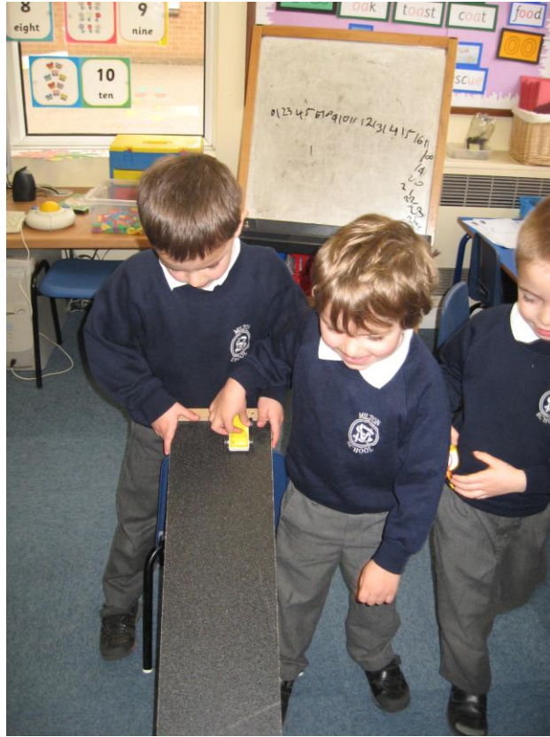
Investigating the speed of cars travelling down a ramp