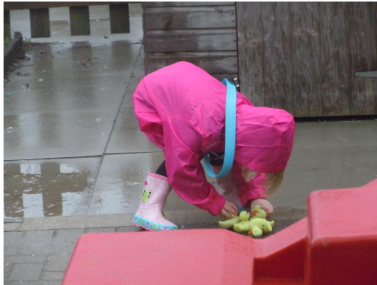
Do ducks float on puddles?