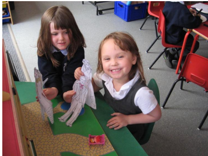
Playing together and developing social skills