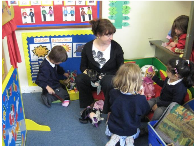
Telling stories using puppets