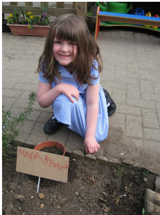
Labelling seeds planted in the garden