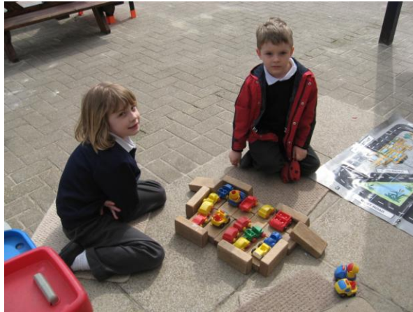
Playing and learning together in the outside area